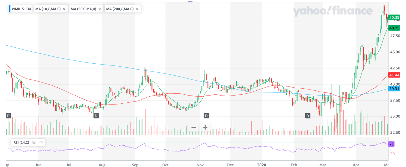
1 Year Chart For Weis Markets, Inc.($WMK)

https://www.weismarkets.com/investor-relations