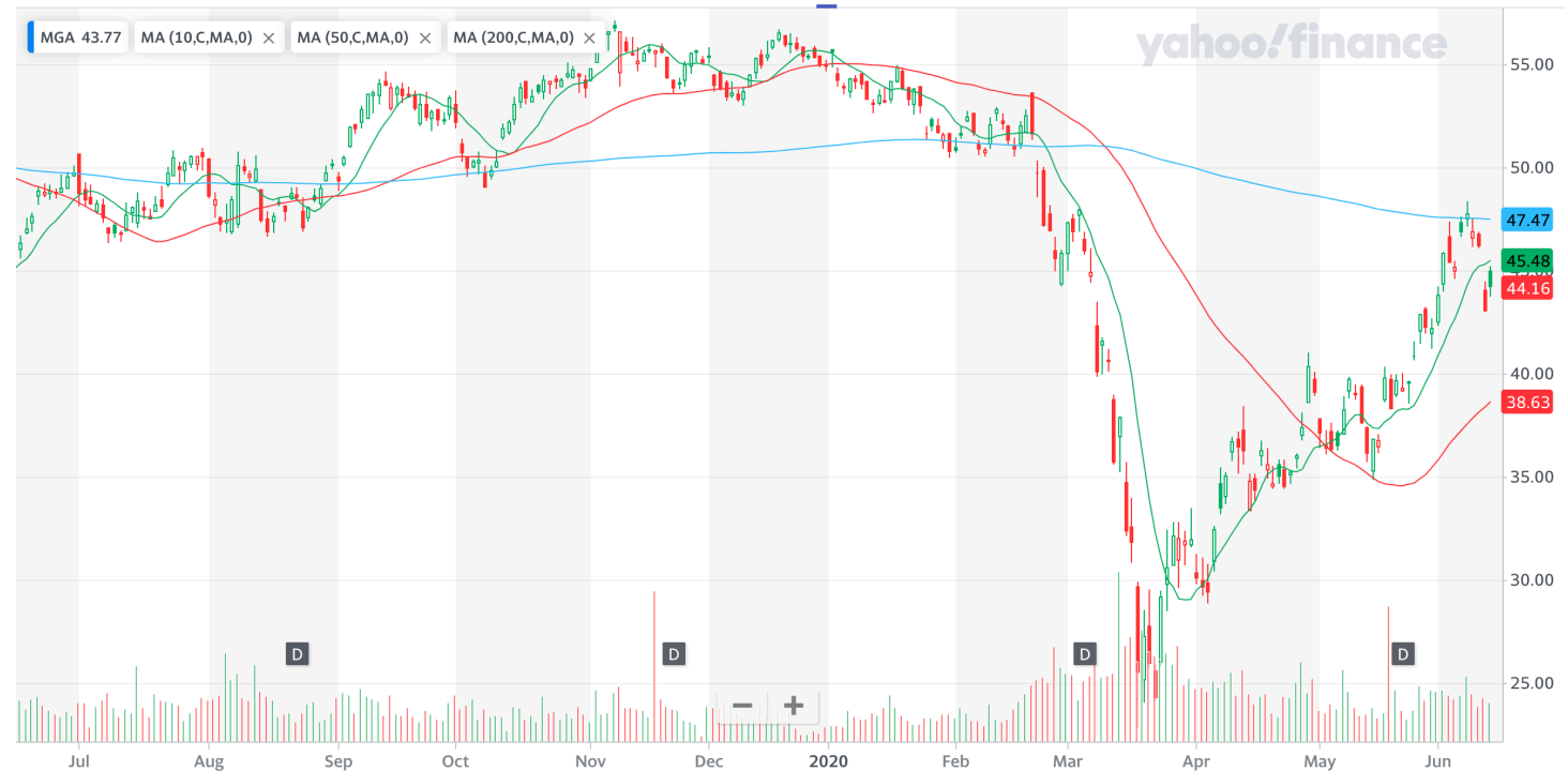
1 Year Chart For MGA Stock