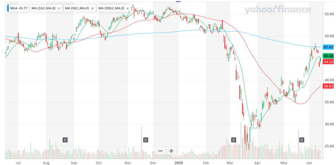
1 Year Chart For Magna International, Inc. ($MGA)

https://www.magna.com/company/investors/shareholder-information/stock-performance