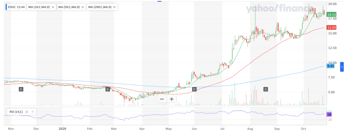
1 Year Chart For Educational Development Corp. ($EDUC)